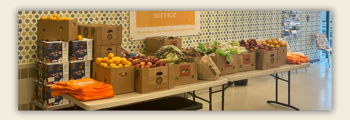
of food pantry bags contained fresh fruits and vegetables